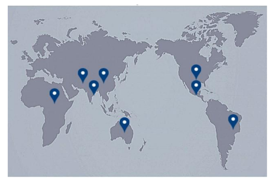
Figure 1. Tamarindus indica global distribution. The blue arrows indicate the countries in which Tamarind is cultivated.

Pharmacological interest in tamarind seed and its components (TSP) first arose with the discovery of their use in traditional medicine for the treatment of diarrhea, dysentery and bleeding, and intensified following the identification of many active constituents<sup>2,4</sup>. TSP, also known as galactoxyloglucan, is composed of the monomers glucose, galactose and xylose in a 3:1:2 ratio, with a molecular weight of roughly 52 kDa (Figure 2). According to literature, TSP is hydrophilic, stable over a wide pH range, has no ionic charge, and is neither toxic nor carcinogenic, making it an excellent candidate for use in pharmaceutical preparations<sup>5</sup>. In this article we will demonstrate TSP's potential for use in ophthalmic formulations, especially for those diseases/conditions in which TSP's properties prove especially useful such as: dry eye disease (DED), glaucoma, bacterial keratitis, in addition to improving the performance of mydriasis stimulants used in clinical examinations.